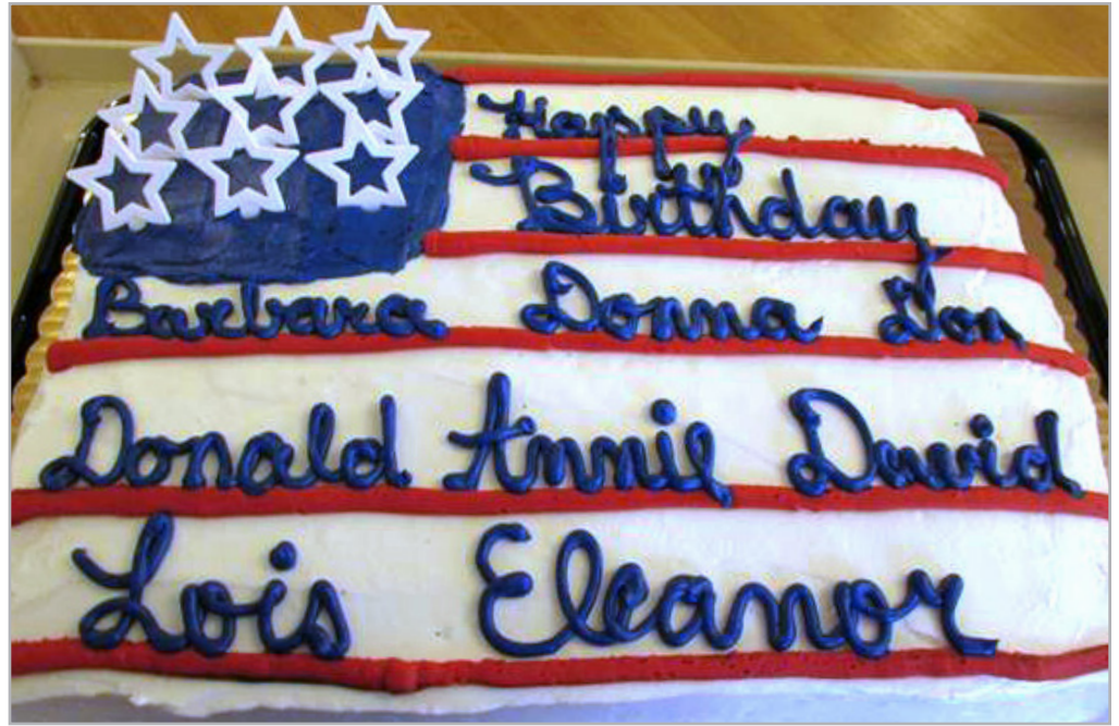
The Birthday Bash fell on Flag Day (June 14th) we thought we'd have a patriotic cake.

"The Birthday Bash for July 2017 will be held on Wednesday, July 12th, 2017 at 2:30p.m. in the Dining Room of the Yale Medilodge. Please join us in the celebration!"